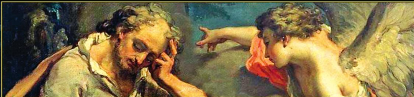
Joseph's Dream (1790) - Gaetano Gandolfi

...all flesh shall see the salvation of God.